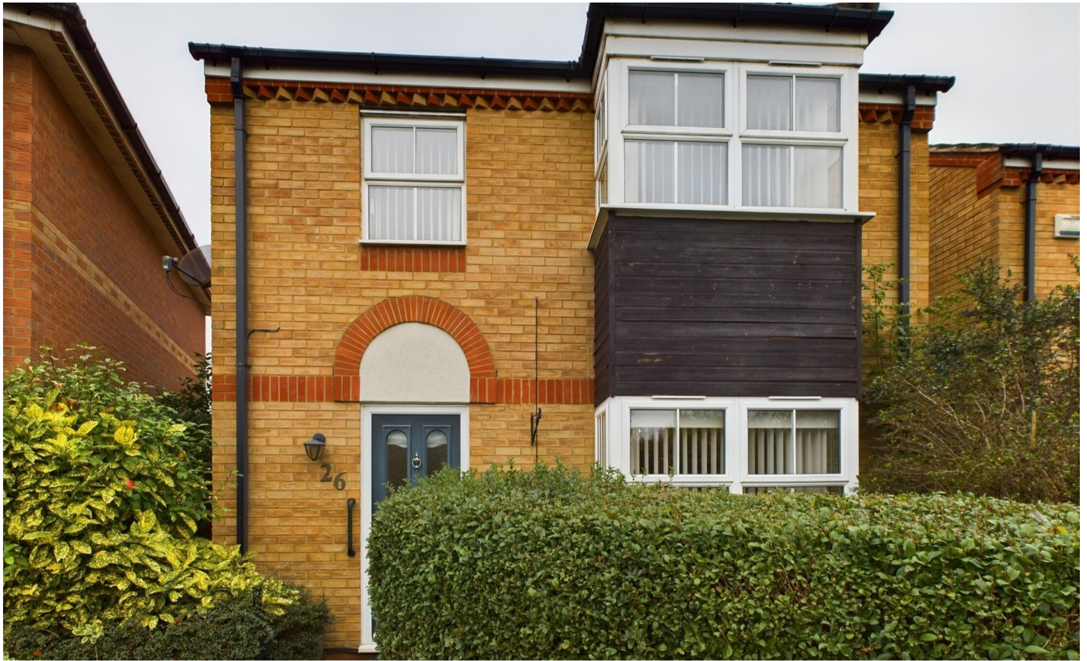
Tenison Manor, Cottenham CB24 8XL