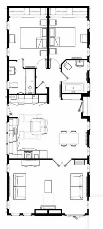
• Spacious Lounge