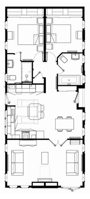
This drawing has been prepared for diagrammatic purposes only. Not to scale