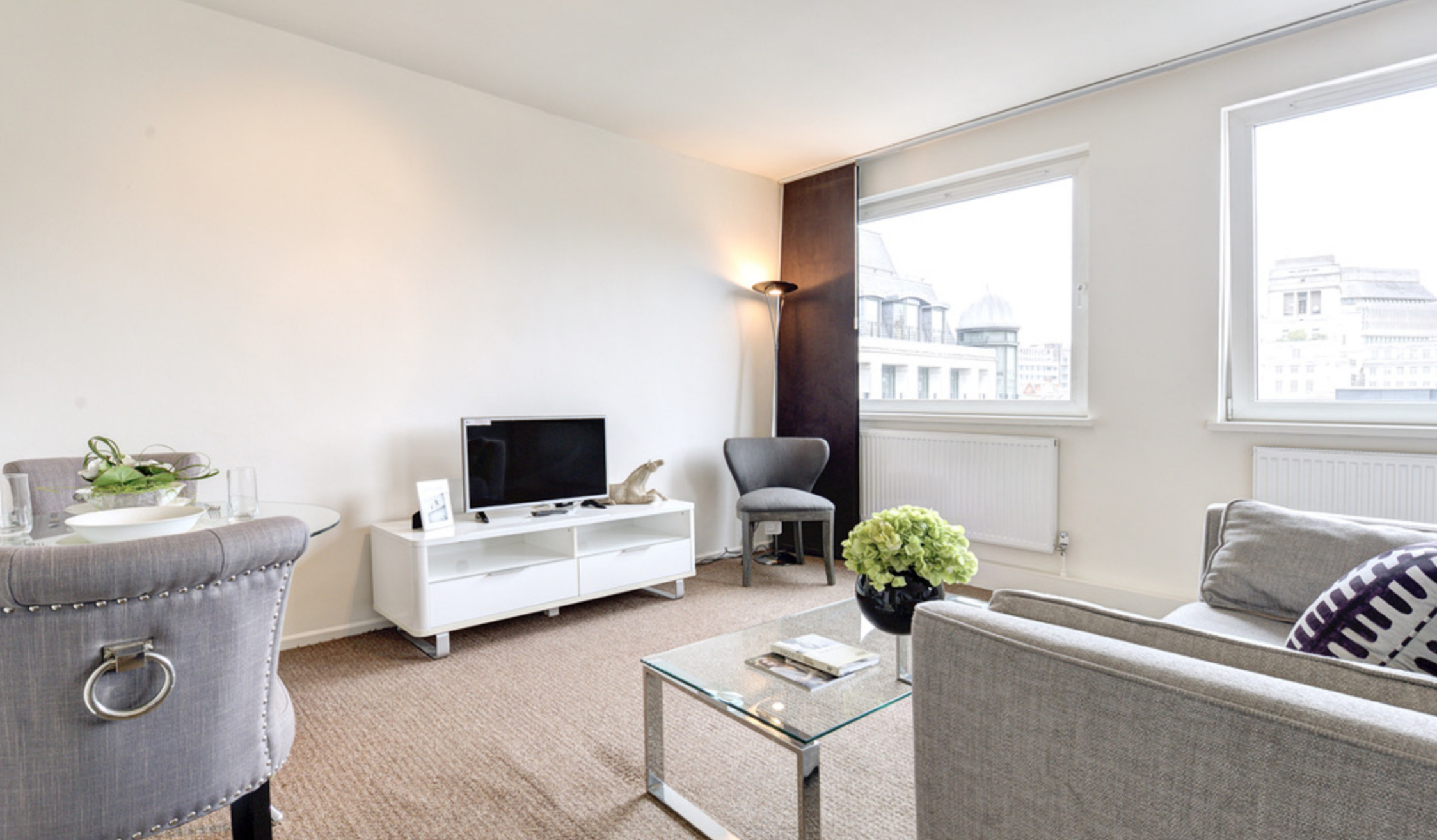
Studio Bedroom 1 bath Flat, Westminster, London SW1