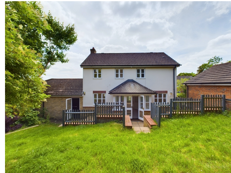
Falcon Rise, Downley, High Wycombe, Buckinghamshire, HP13 5JT