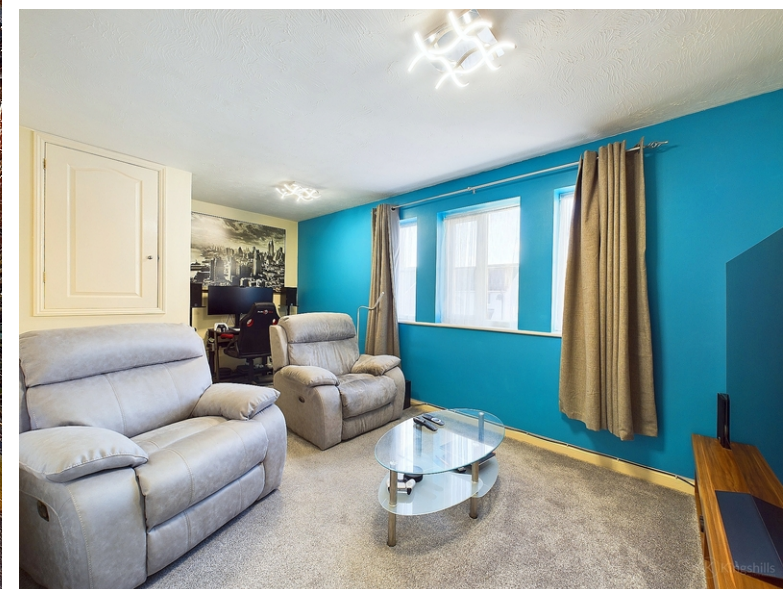
12 Falcon Rise, Downley, High Wycombe, Buckinghamshire, HP13 5JT