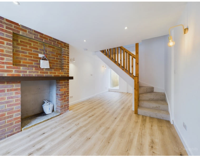
76 The Row, Lane End, High Wycombe, Buckinghamshire, HP14 3JU