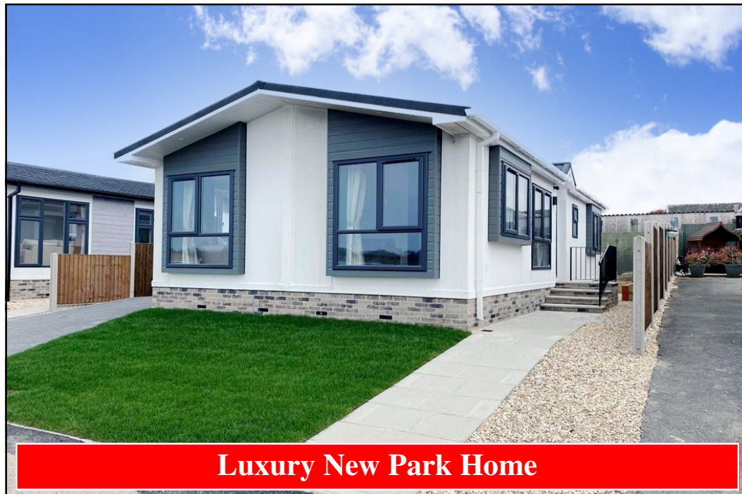
Luxury New Park Home

32 Westwood Park, Bashley Cross Road, New Milton. BH25 5TB