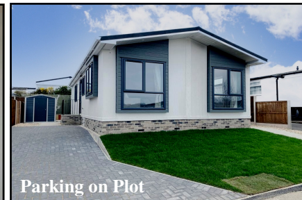
Parking on Plot