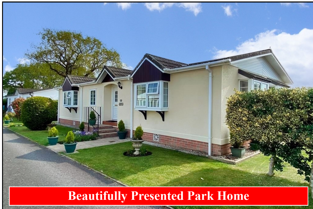
Beautifully Presented Park Home

25 St Leonards Farm Park, Ringwood Road, West Moors, Dorset. BH22 0AG