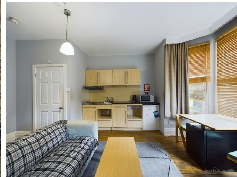
Amersham Hill, High Wycombe, Buckinghamshire, HP13 6NU