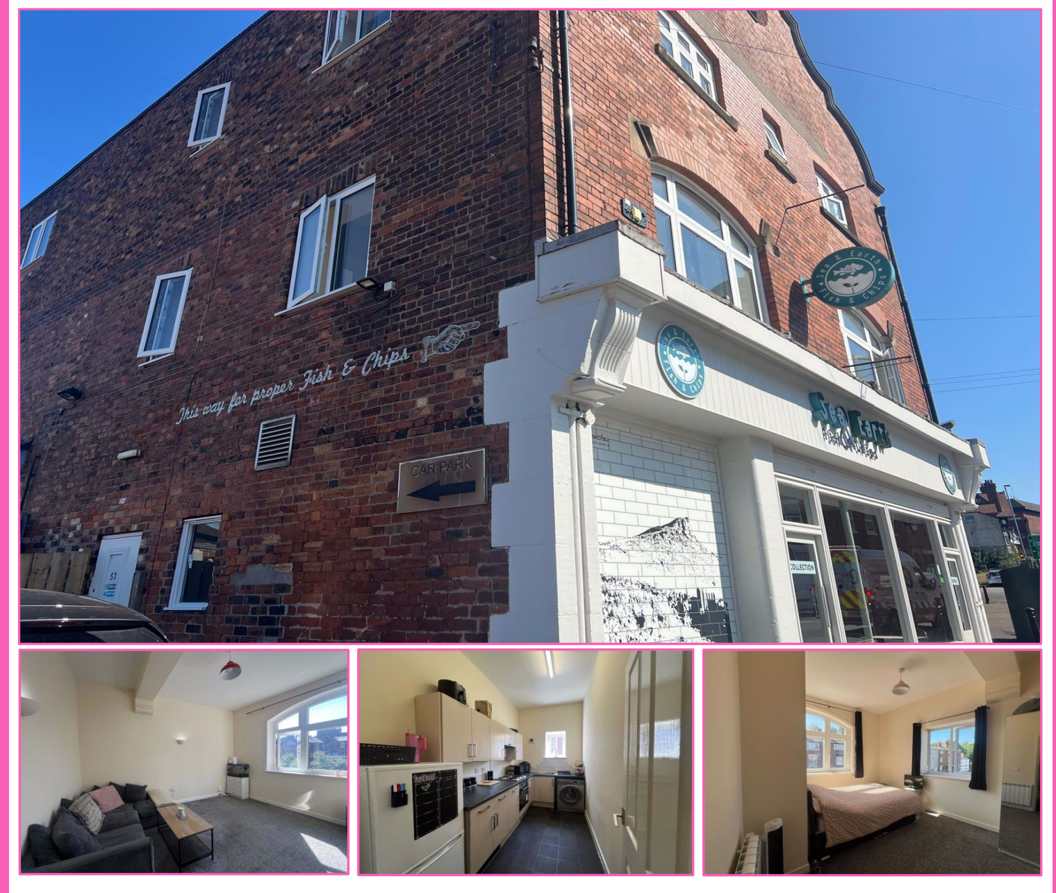
Apartment 2, 52 Broad Street, Leek, Staffordshire, ST13 5NS