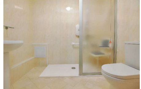
Chelmsford £130,000 1-bed retirement property