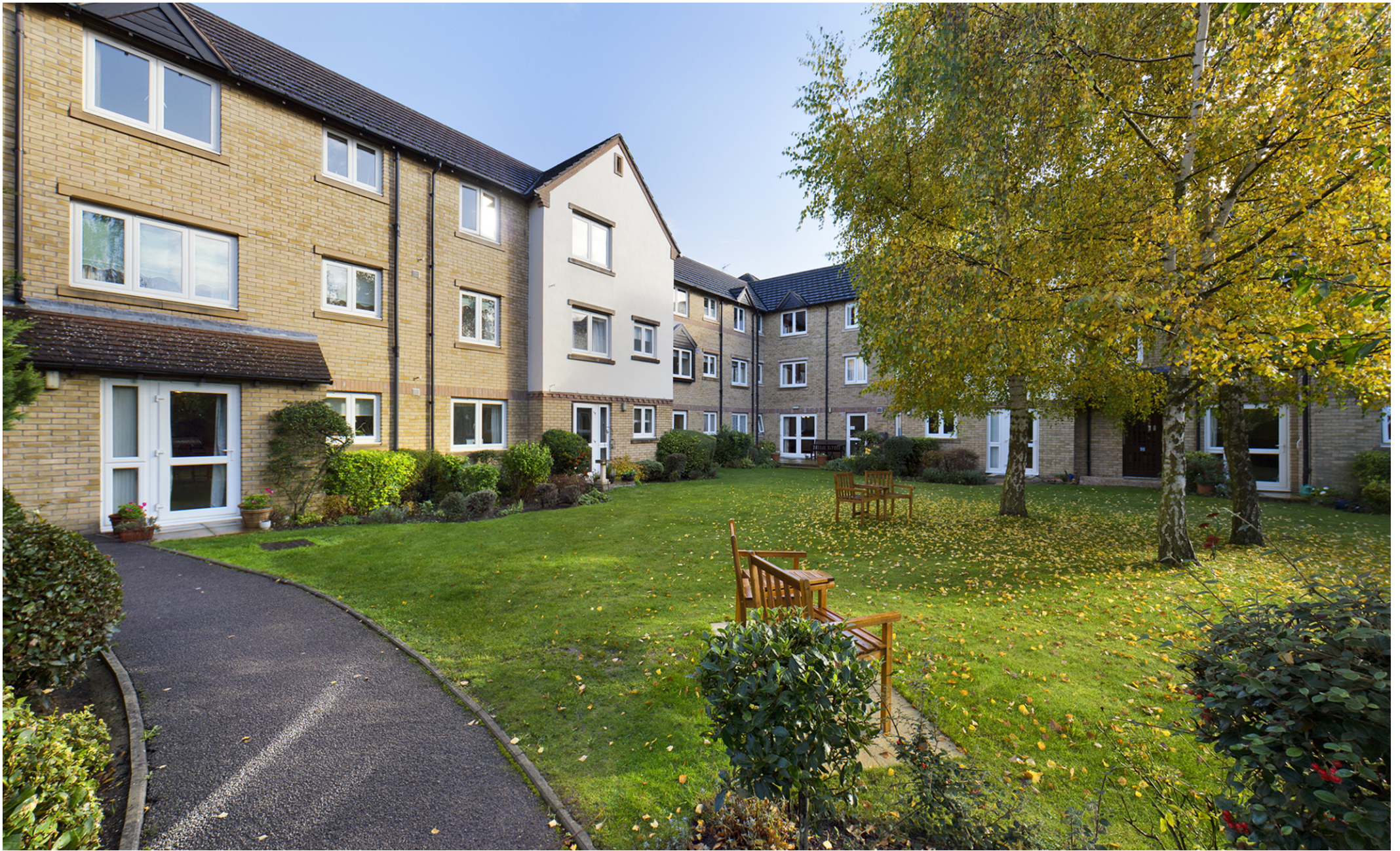
Haig Court, Cambridge CB4 1TT