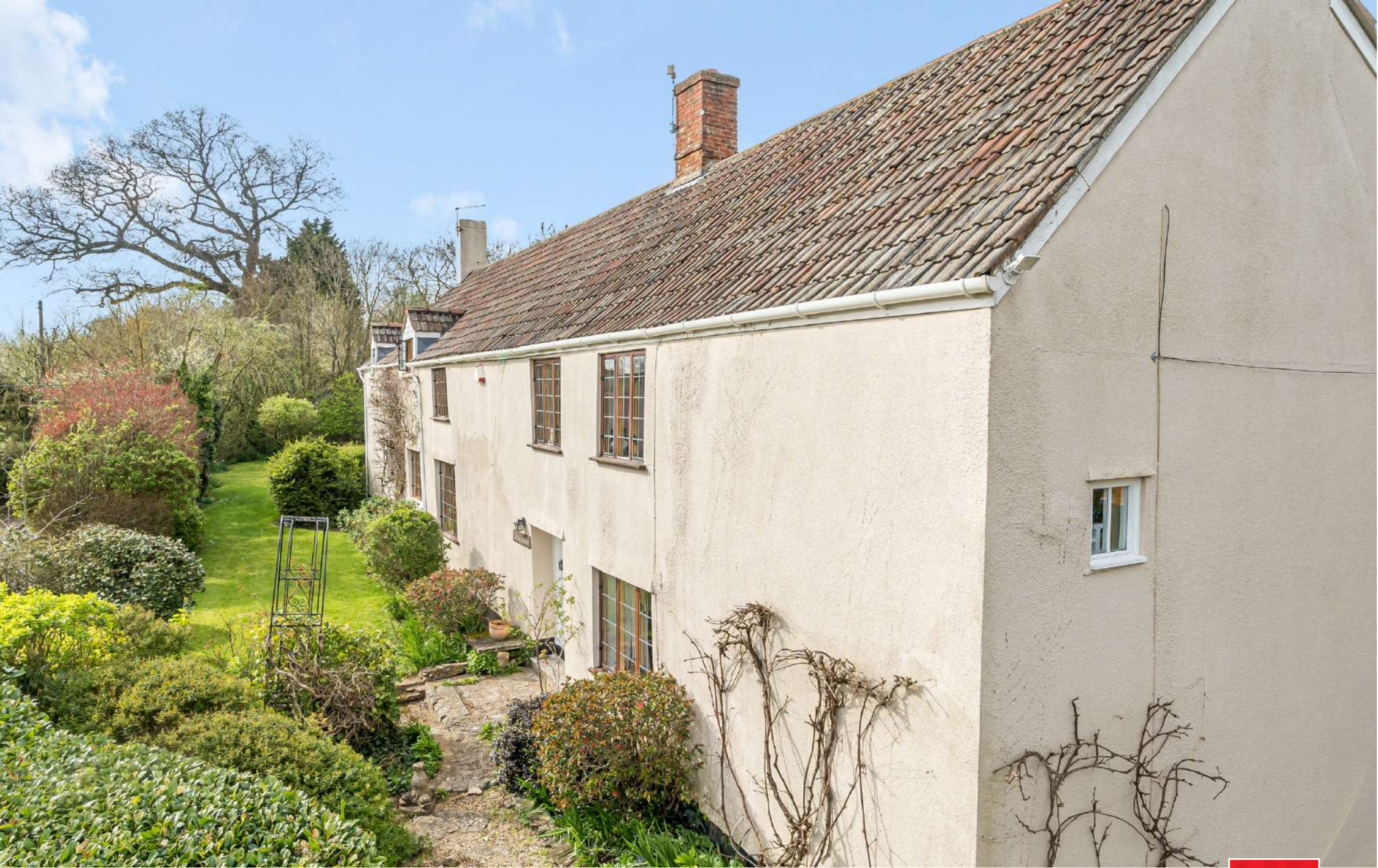
Little Kibbear Taunton TA3 7LN