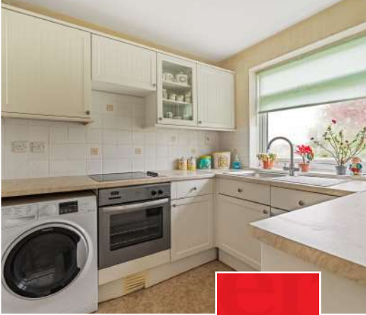
Flat 1 Haseley Court Ferndown Close, Taunton TA1 4TL £180,000