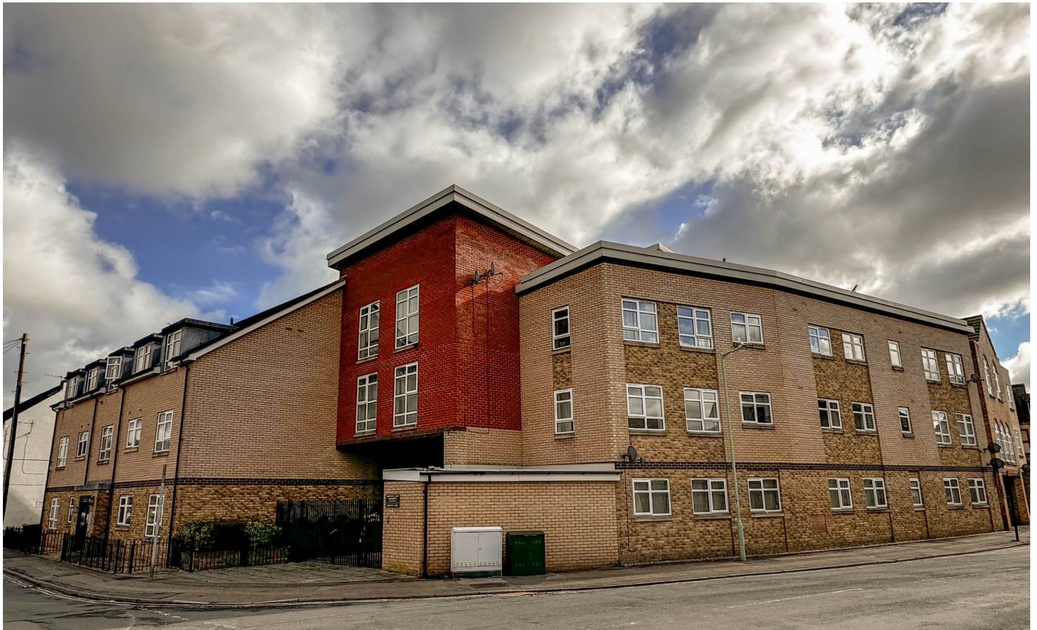
Ashbourne Court, All Saints Road, Newmarket