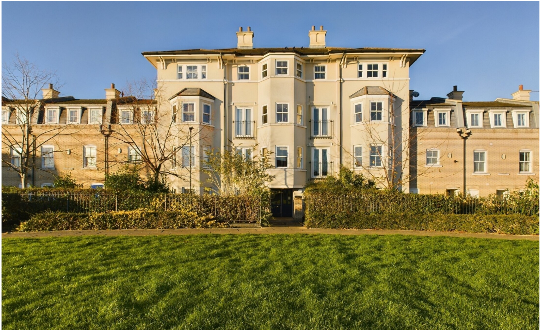
St. Matthews Gardens, Cambridge CB1 2PJ