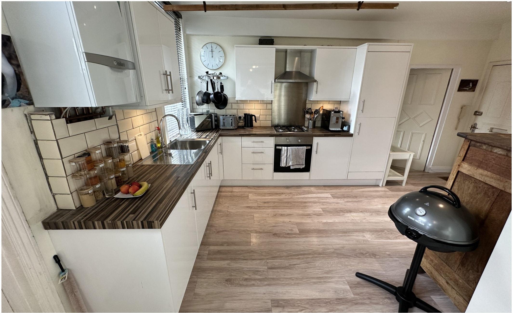
Clarendon House, High Street, Newmarket