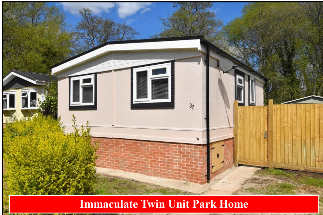
Immaculate Twin Unit Park Home

32 Redhill Park, Wimborne Road, Redhill, Bournemouth. BH10 7BW