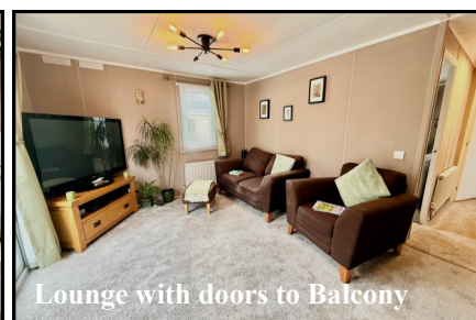
Lounge with doors to Balcony