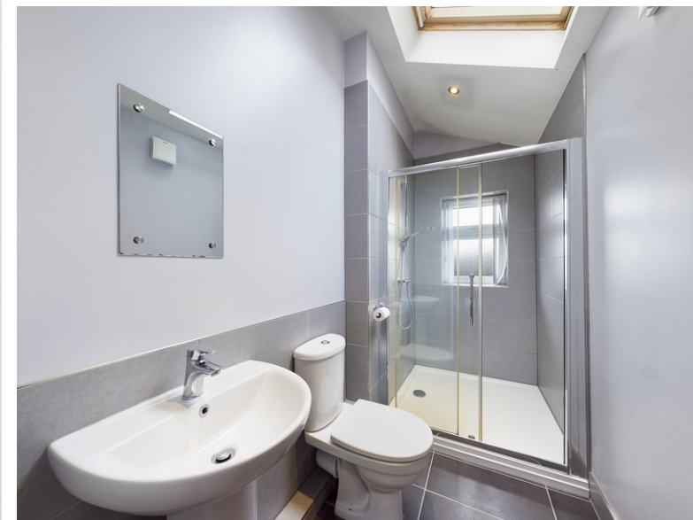
Room 3 37 Guinions Road, High Wycombe, HP13 7NT