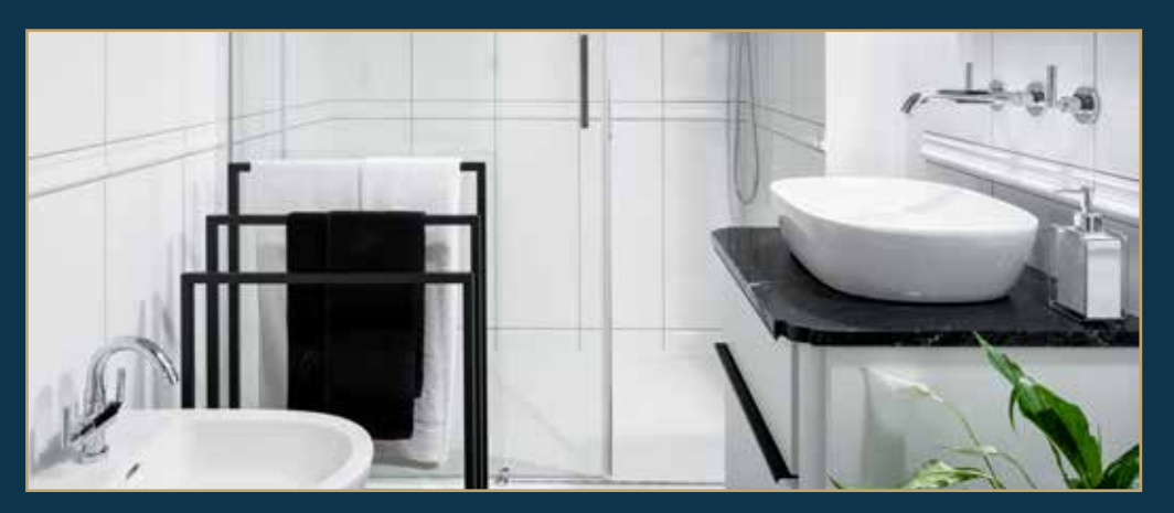
The project is designed with an energy efficient and environmentally friendly design brief to ensure the apartments exceed today's current standards.