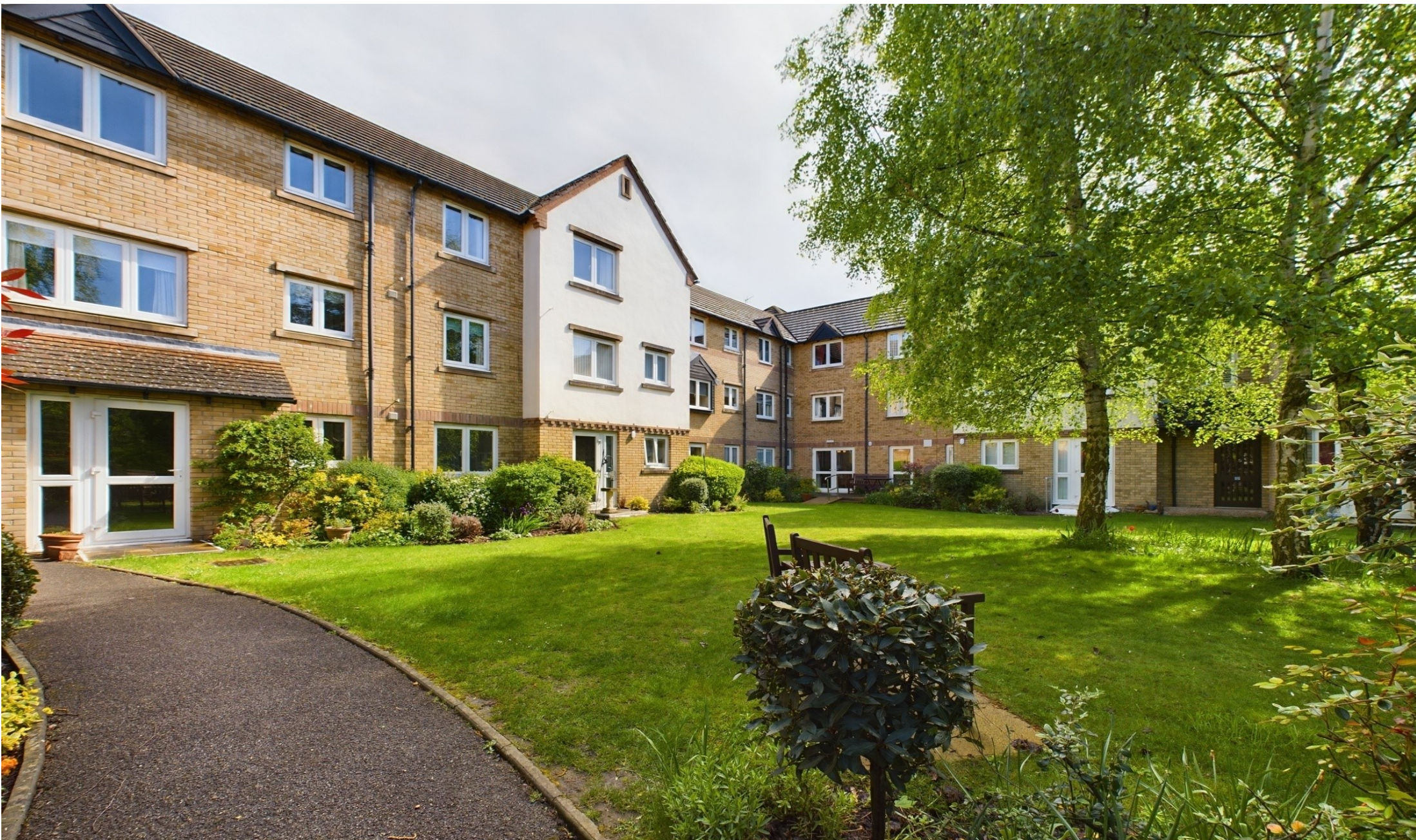
Haig Court, Cambridge CB4 1TT