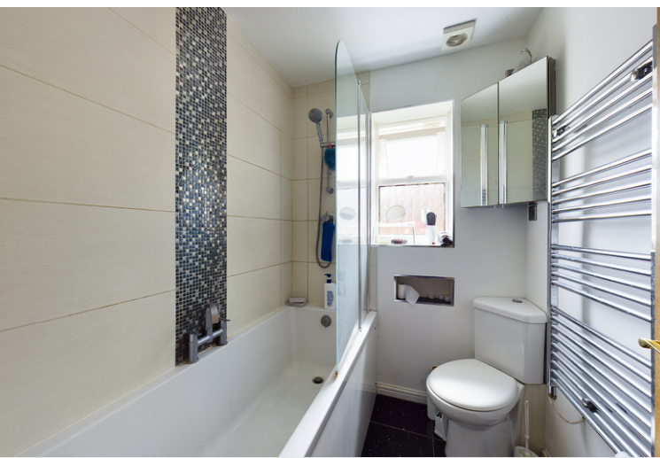
Blackthorn Close, Cambridge, CB4 1FZ

£1,250 pcm Unfurnished 1 Bedrooms Available from 20/05/2024