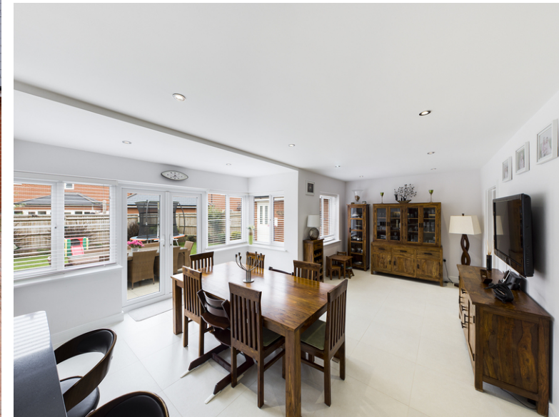
51 Sierra Road, High Wycombe, Buckinghamshire, HP11 1GX