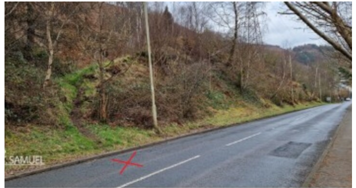
...mo Road, Mountain Ash, CF45 3NB (nearest postcode). What3words entrance point (Re