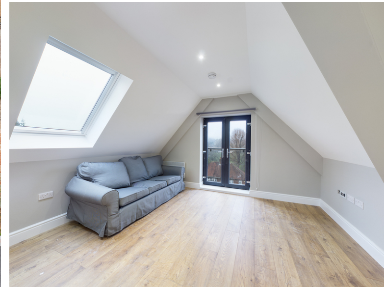
Flat 18 Sekhon House 144-146 Kingsmead Road, High Wycombe, HP11 1UZ