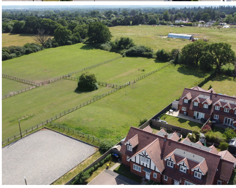
13 Colborne Close, Iver, Buckinghamshire, SL0 0AF