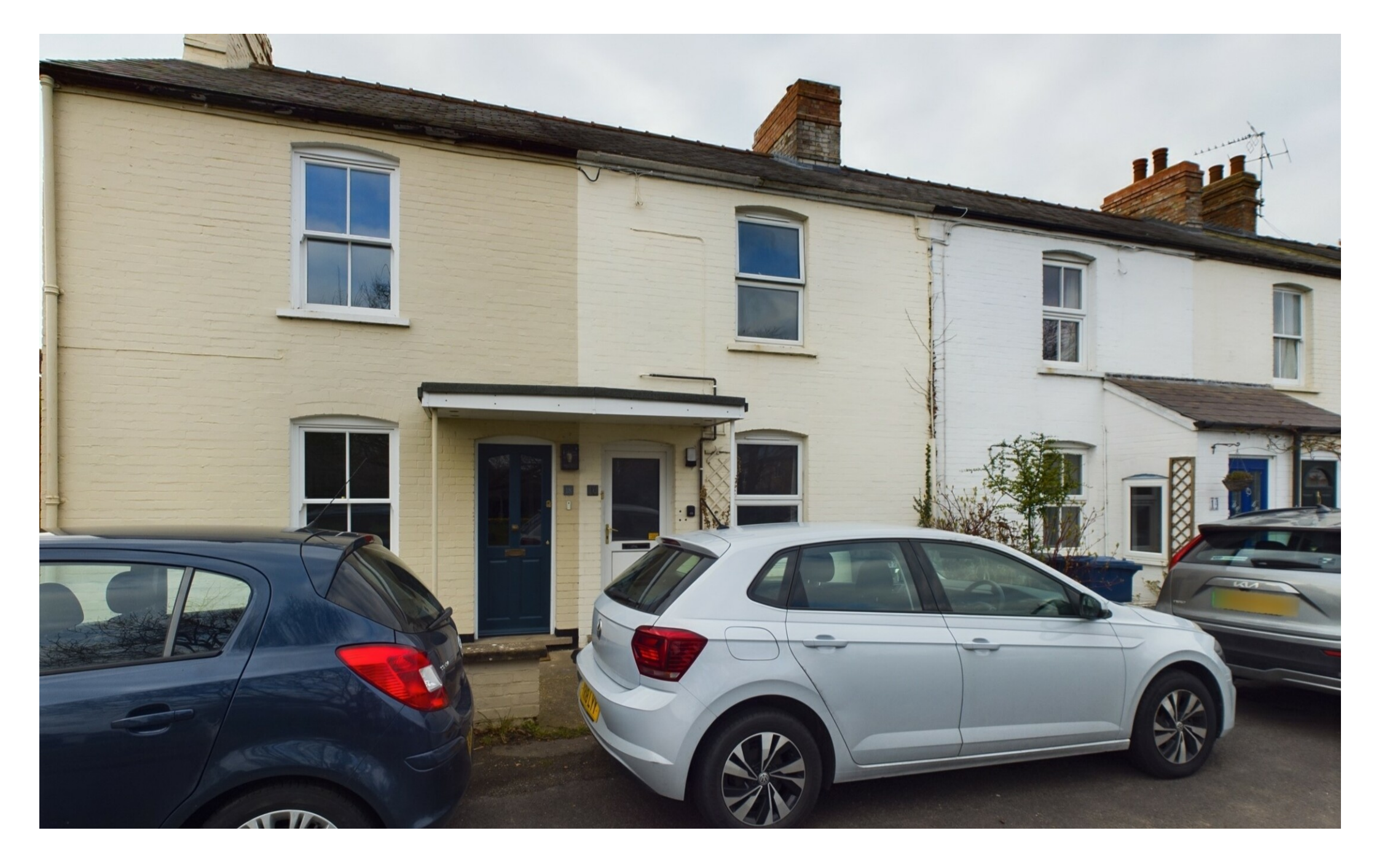
The Lane, Hauxton CB22 5HP