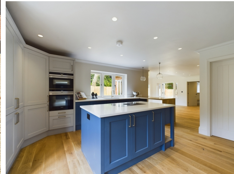
3 Appleyard Close, Whitchurch, Aylesbury, Buckinghamshire, HP22 4FX