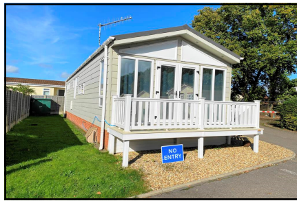
Pitch Fee: approx £276 per month Subject to Annual Review Council Tax Band: 'A' Tenure: 1983 Mobile Homes Act Agreement

VIEWING STRICTLY BY APPOINTMENT WITH THE VENDOR'S AGENT Dorset Park Homes 01202 877511