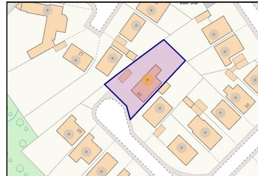
Plot Plan for identification purposes only