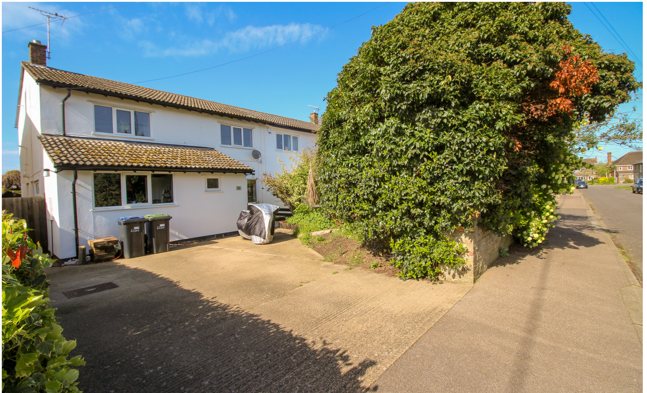
Mill Road, Lode, Cambridge