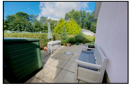
Pitch Fee: approx £167.47 per month Subject to Annual Review Council Tax Band: 'B' Tenure