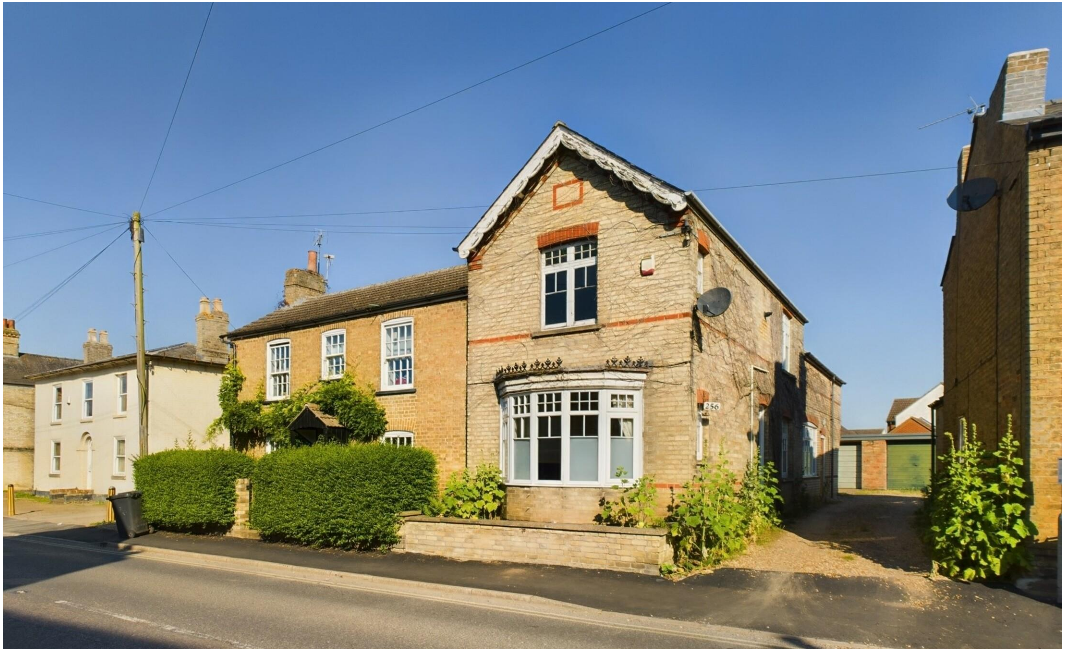
High Street, Cottenham