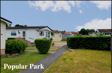
Pitch Fee: Approx £190 per month Subject to Annual Review Council Tax Band: 'A' Tenu

Council Tax Band: 'A' Tenure: 1983 Mobile Homes Act Agreement