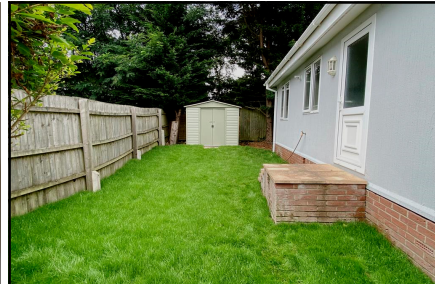
Pitch Fee: approx £216.23 per month Subject to Annual Review Council Tax Band: 'A' Tenure; 1

Tenure ; 1983 Mobile Homes Act Agreement