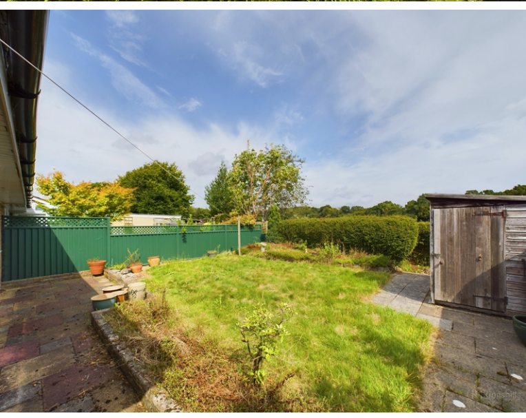
22 Fernside, Great Kingshill, High Wycombe, Buckinghamshire, HP15 6HN