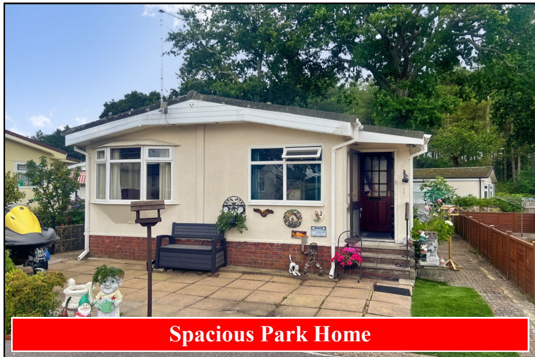
Spacious Park Home

3 The Paddock, Oaktree Park, St Leonards, Nr Ringwood. BH24 2RW