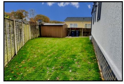
Pitch Fee: approx £238.65 per month Subject to Annual Review Council Tax Band: 'A' Tenure: 1983 Mobile Homes Act Agreement