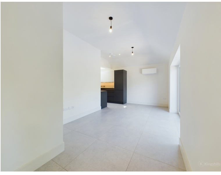
Chapel Lane, High Wycombe, Buckinghamshire, HP12 4BS