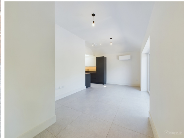
5 Sands House, 65-67 Chapel Lane, High Wycombe, Buckinghamshire, HP12