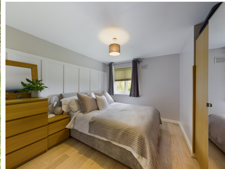
Andrews House, Tadros Court, High Wycombe, HP13 7GF