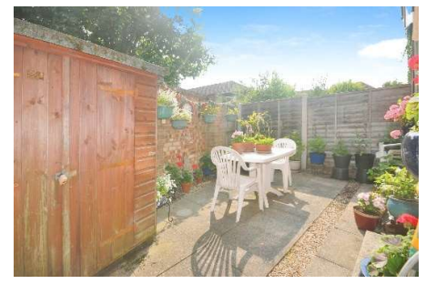
Chelmsford £170,000 1-bed ground floor maisonette