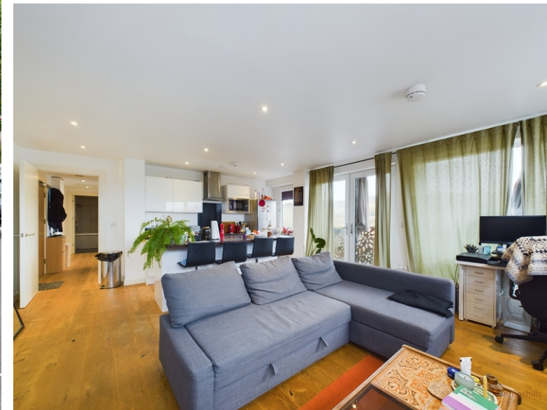
Westfields House, London Road, High Wycombe, Buckinghamshire, HP11 1HA