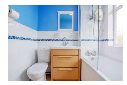
Old Moulsham Guide Price £525,000 3-bed semi detached house