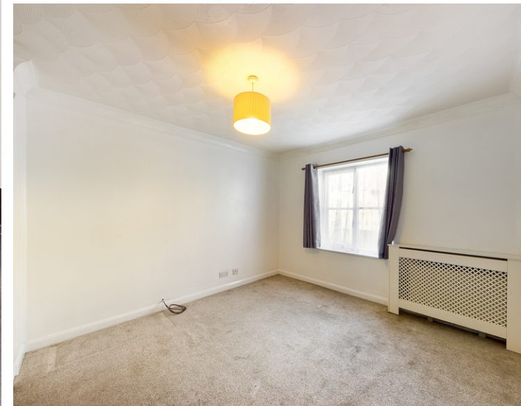
Flat 4, West Wycombe Road, High Wycombe, Buckinghamshire, HP12 3AB