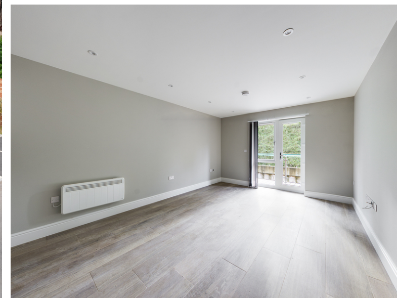
Sekhon House 144-146 Kingsmead Road, High Wycombe, HP11 1UZ