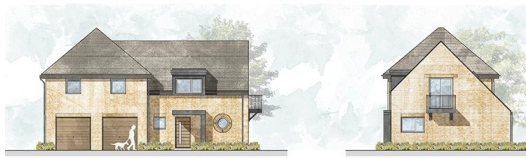
Plot 28 - Thea