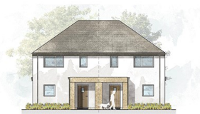
Plot 29 & 30 - Clara