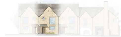
Plots 33 to 35 - Daisy