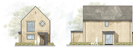
Plots 31 & 32 - Daisy