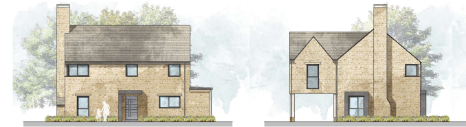
Plot 36 - Sofia