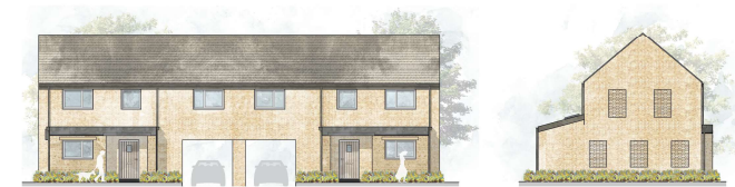
Plot 47 & 48 - Rose

To view this property call The Real Estate Bureau Ltd on: (01305) 826 999