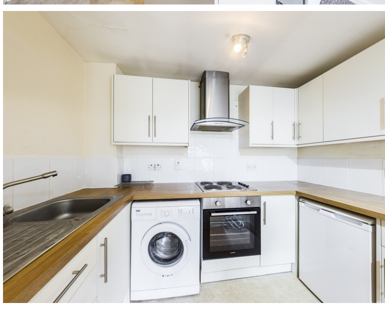
Fryers Court Eaton Avenue, High Wycombe, Buckinghamshire, HP12 3AT