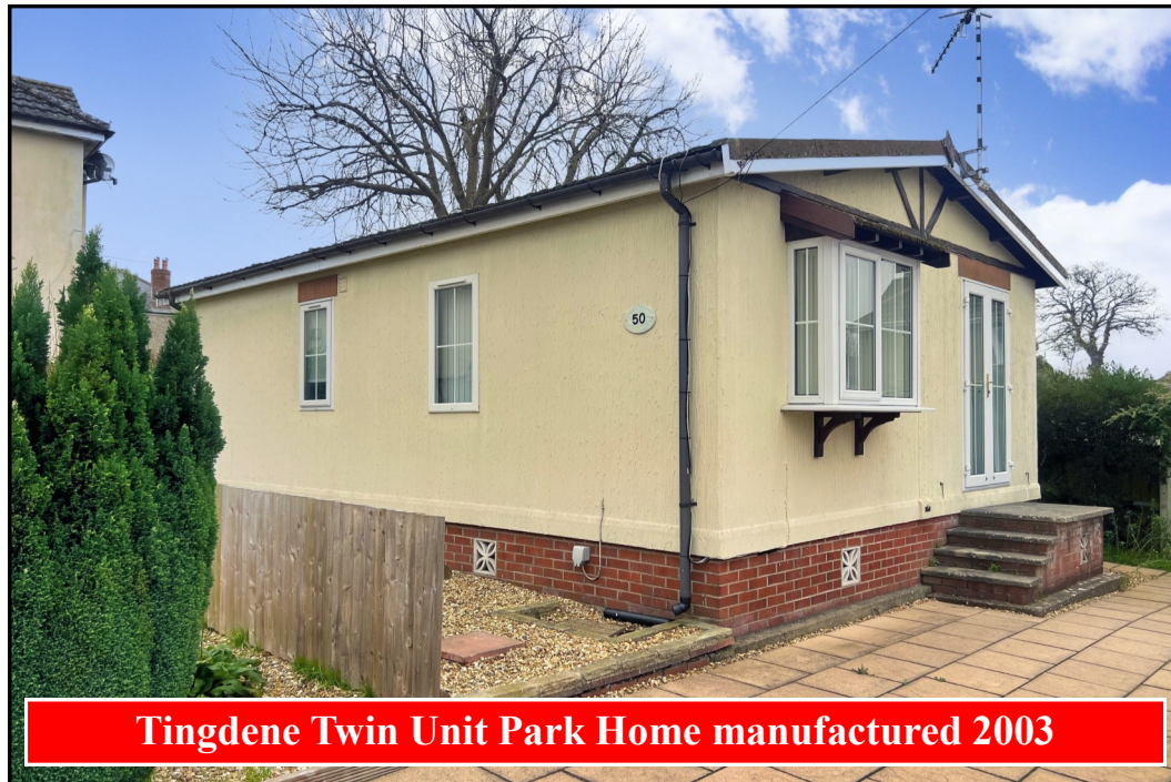
Tingdene Twin Unit Park Home manufactured 2003

50 Doveshill Park, Barnes Road, Ensbury Park, Bournemouth. BH10 5AJ