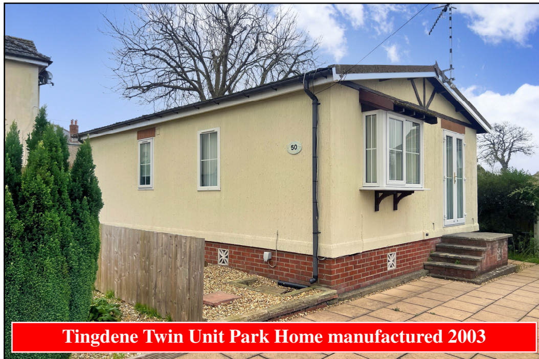
Tingdene Twin Unit Park Home manufactured 2003

50 Doveshill Park, Barnes Road, Ensbury Park, Bournemouth. BH10 5AJ